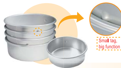
1.0mm Al. Alloy Anodized