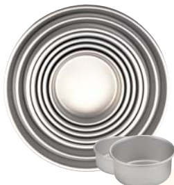
1.0mm Al.Alloy Anodized