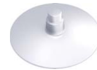
SN5284 / SN5285