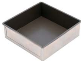
1.0mm Al. Alloy Non-stick