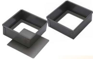
1.0mm Al. Alloy Hard Anodized