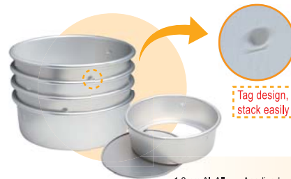
1.0mm Al. Alloy Anodized