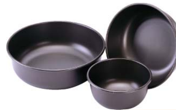
1.0mm Al. Alloy Hard Anodized