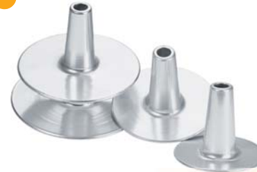
1.0mm Al. Alloy Anodized