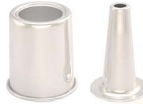
1.0mm Al. Alloy Anodized