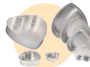
SN6851 3" Heart Pan 73x68x27 SN6852 4" Heart Pan 93x88x35 SN6853 5" Heart Pan 118x111x40 SN6854 6" Heart Pan 142x134x55 SN6856 8" Heart Pan 189x178x60 SN6858 10" Heart Pan 236x222x67