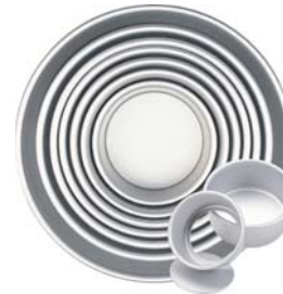
1.0mm Al. Alloy Hard Anodized