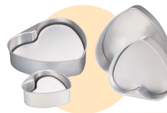
SN6844 6" Heart Pan-Removable Bottom 142x134x55 SN6846 8" Heart Pan-Removable Bottom 189x178x60 SN6848 10" Heart Pan-Removable Bottom 236x222x67