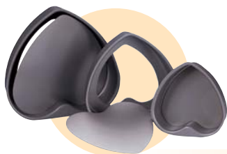
SN6904 6" Heart Pan-Removable Bottom 142x134x55 SN6906 8" Heart Pan-Removable Bottom 189x178x60 SN6908 10" Heart Pan-Removable Bottom 236x222x67