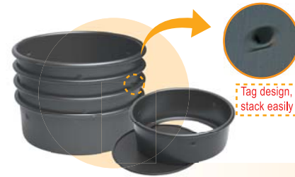
1.0mm Al. Alloy Hard Anodized

Small tag, big function, conveniently stacking Patent No. : 200720042980.7