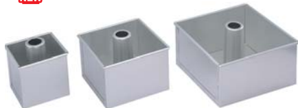
1.0mm Al. Alloy Anodized