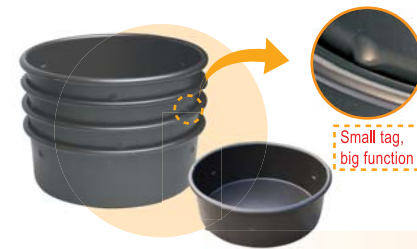
1.0mm Al. Alloy Hard Anodized