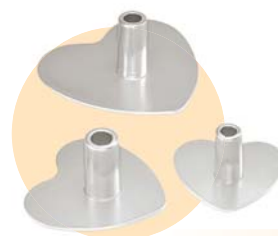
SN5298 6" Heart Cake Tube 138x130x70 SN5299 8" Heart Cake Tube 188x177x75 SN5300 10" Heart Cake Tube 235x222x80