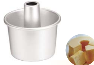
1.0mm Al. Alloy Anodized