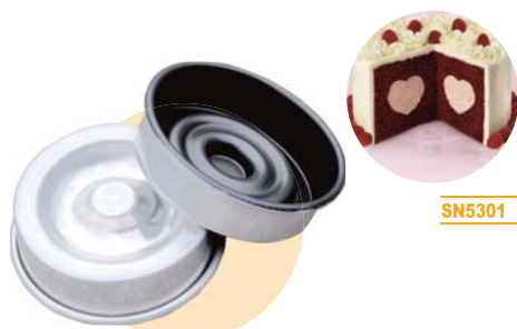
SN5301 6" Layer Cake Pan 152x148x90