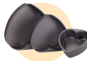
SN6914 6" Heart Pan 142x134x55 SN6916 8" Heart Pan 189x178x60 SN6918 10" Heart Pan 236x222x67