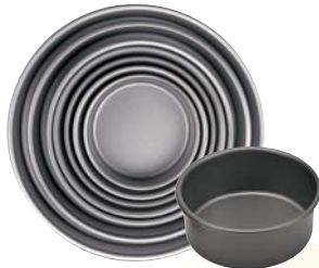
1.0mm Al.Alloy Anodized