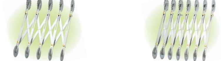
SN4227 Expandable Dough Cutter-Two-sides 5 Wheels Length 260