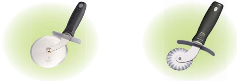
SN4241 Pizza Cutter ø102x243