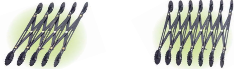
SN4219 Expandable Dough Cutter-Two-sides 5 Wheels Length 260