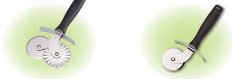
SN4244 Pizza Cutter ø 52x175