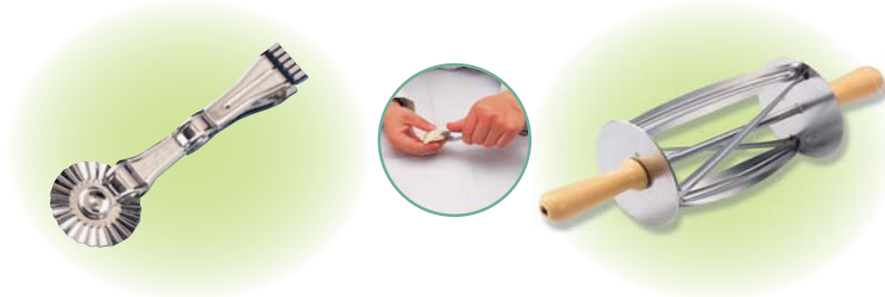
SN4230 Cookie Cutter Lenght 203